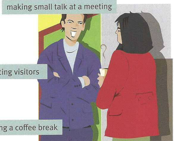
making small talk at a meeting