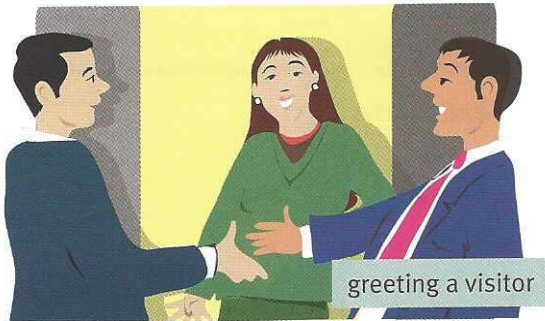
greeting a visitor