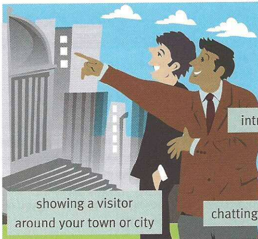
showing a visitor around your town or city

First look at some of the activities involved in socializing. Can you add anything?